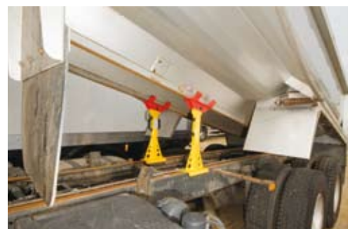
Figure 6 Props for a tipper lorry