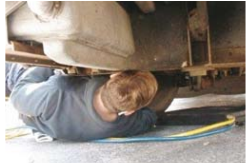
Figure 7 Limited clearance even with full suspension