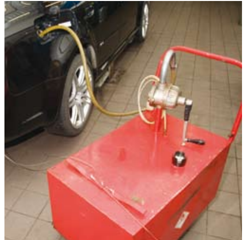
Figure 9 Fuel retriever – note metal collection tank and earthing straps