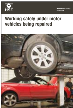
This is a web-friendly version of leaflet INDG434