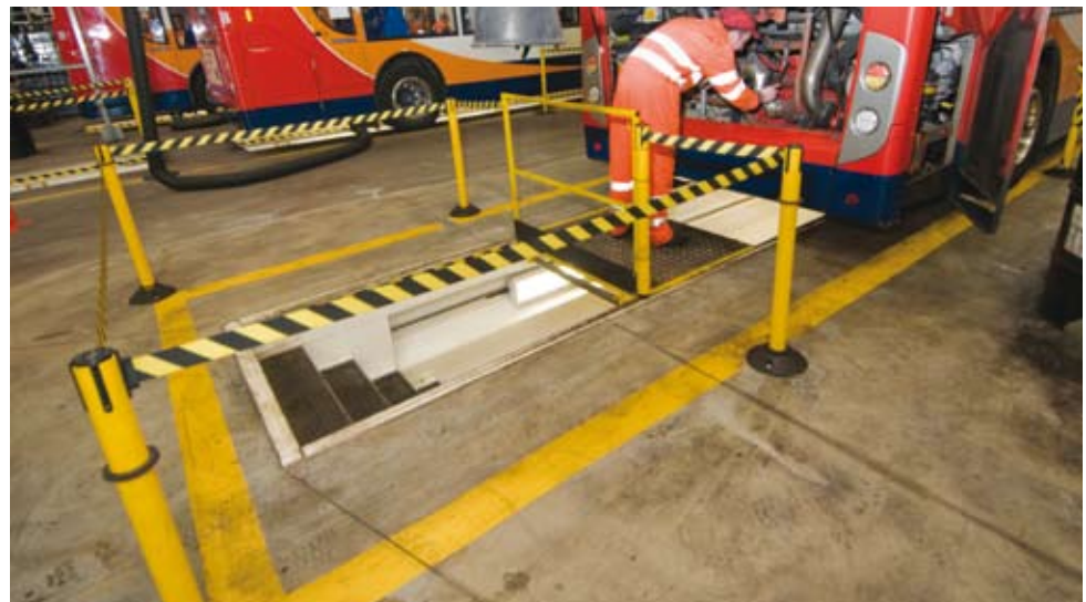
Figure 8 Extendible barriers warn workers about the open pit area

A self-employed garage owner was found dead in a vehicle inspection pit. There was a car over the pit with the engine running. It is believed he was repairing the exhaust pipe when he was overcome with carbon monoxide fumes.