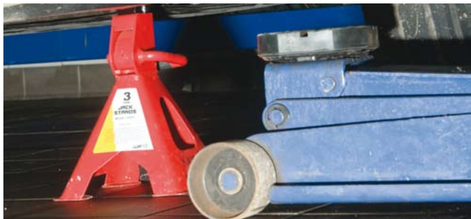
Figure 1 Car with trolley jack and axle stand on a firm, level surface