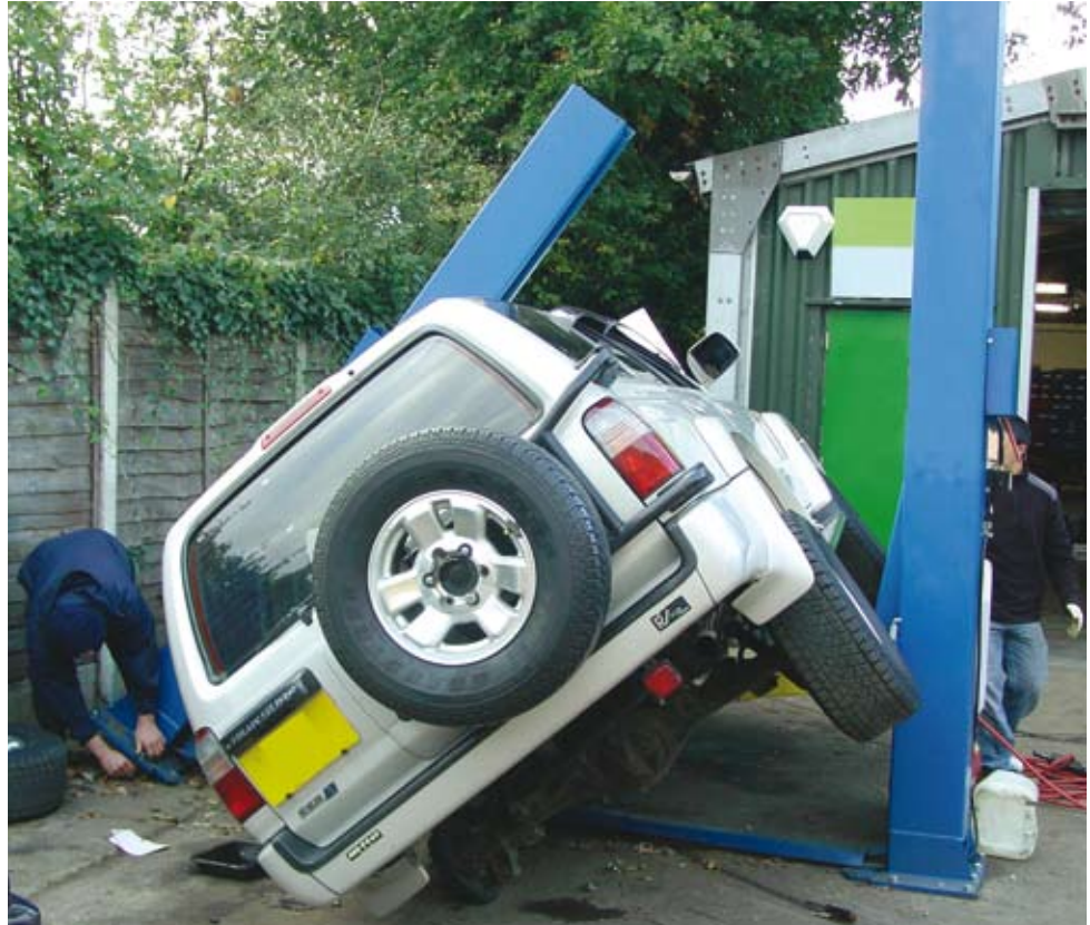
Figure 2 A collapsed two-post lift