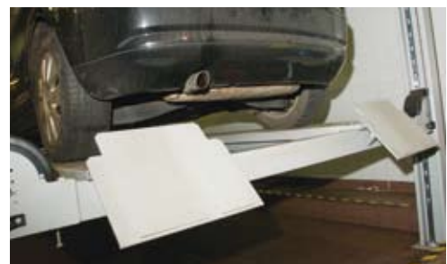
Figure 4 Hinged end-stops help prevent the vehicle falling from the lift when elevated