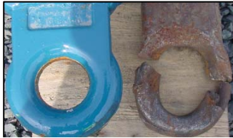
Check drawbar rings for wear