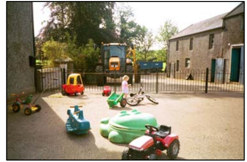
A safe play area for children

If the trailer makes contact or comes close to live power cables, try to lower the body and drive away. If you have to leave the combination in position and get out of the cab – JUMP WELL CLEAR – DO NOT TOUCH THE VEHICLE AND THE GROUND AT THE SAME TIME.