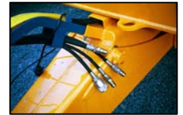
Protect the hoses and cables