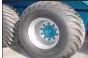
Check wheel nuts regularly