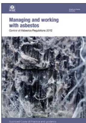
L143 (Second edition) Published 2013

This publication contains the Control of Asbestos Regulations 2012, the Approved Code of Practice (ACOP) and guidance text. Two ACOPs, L127 ( The management of asbestos in non-domestic premises ) and L143 ( Work with materials containing asbestos ) have been consolidated into this single revised ACOP. The presentation and language has been updated wherever possible. It provides guidance text for employers about work which disturbs, or is likely to disturb, asbestos, asbestos sampling and laboratory analysis. It also provides guidance on the specific duty to manage asbestos on the owners and/or those responsible for maintenance in non-domestic premises.